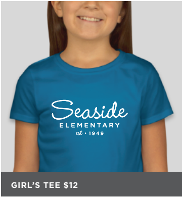
GIRL'S TEE $12