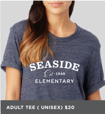
ADULT TEE ( UNISEX) $20