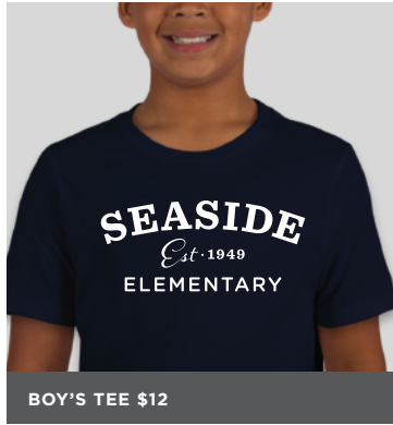
BOY'S TEE $12