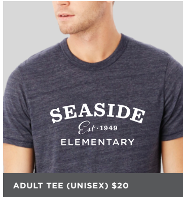
ADULT TEE (UNISEX) $20