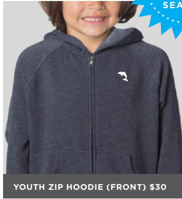
YOUTH ZIP HOODIE (FRONT) $30