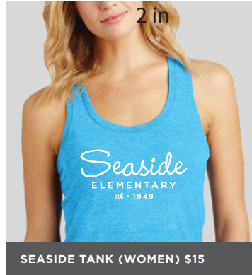
SEASIDE TANK (WOMEN) $15