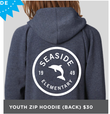
YOUTH ZIP HOODIE (BACK) $30